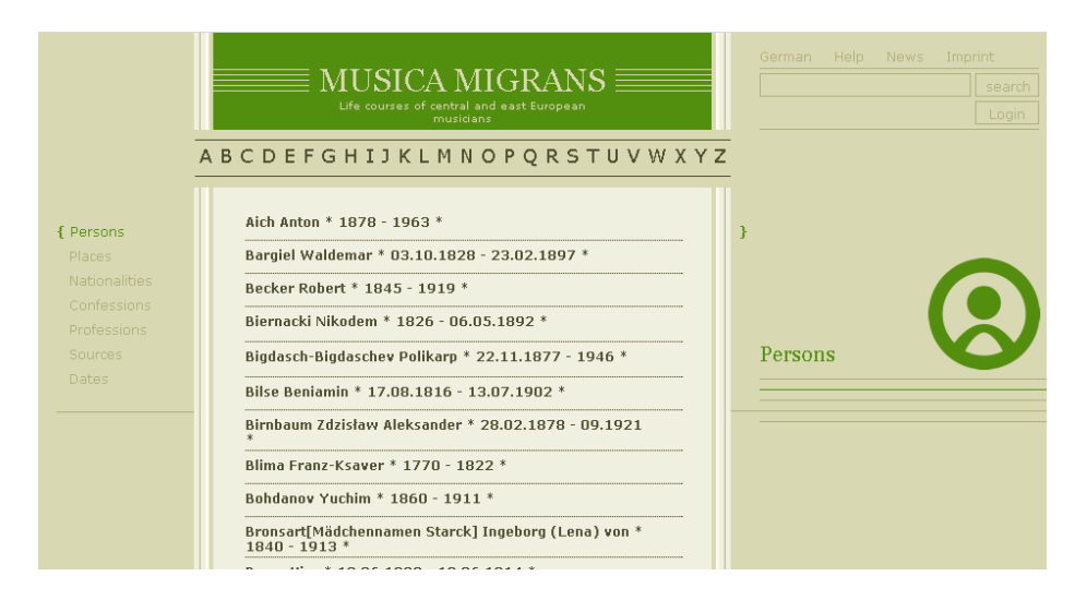
Figure 2: Index page for the type "person" in the TMportal Musica migrans

The domain of this TMportal consists of the life courses of Eastern European musicians in the 19<sup>th</sup> century. The figure above depicts the index page for "person", the main type in the domain ontology. Each entry in the index provides a link to the subject page of the according person.